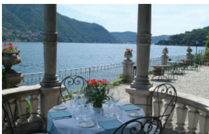
Grand Hotel Imperiale

Ristorante Imperialino, Garden Restaurant, Regina Bar, Regina Lakeside Bar, Outdoor Panoramic Swimming Pool (open May to September), I-Spa, Tennis Court, Nine-hole Putting Green, Two Driving Ranges, Garage Parking, WiFi.