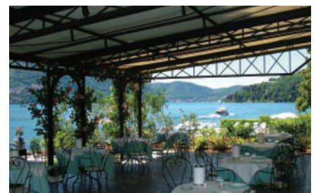
Grand Hotel Imperiale