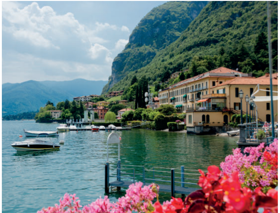
Menaggio on Lake Como

You enjoy a final breakfast at your hotel before starting your journey home. There are regular flights throughout the day between Milan and London giving you plenty of time to drive back to the airport before heading back to the UK.