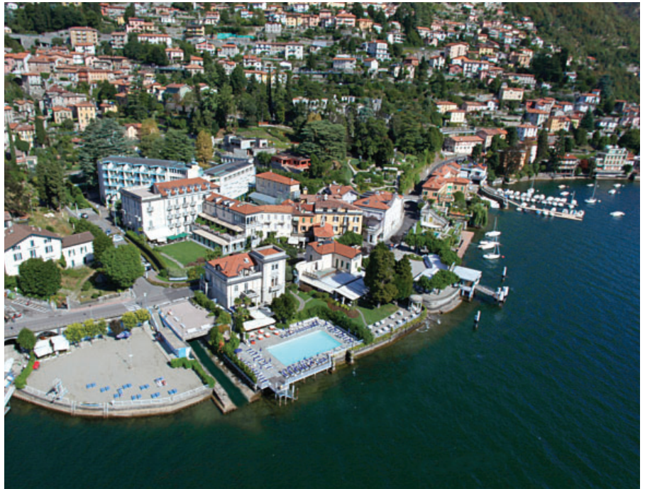
Grand Hotel Imperiale